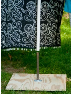
The banner bearer positions the PVC banner pole over the 12-inch tall black pipe.

Do let me know if you can devise a quick and simple way for the banner bearer to secure the PVC pole so that it will not swivel once it is in the display stand. Remember, the fewer parts you have, the fewer will get lost. THE END