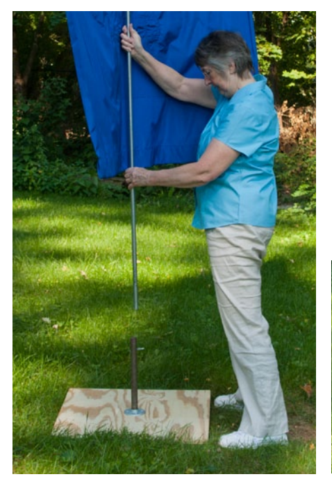
The banner bearer stands close to the stand, and slowly positions the pole above the black pipe. Then gradually and smoothly lower the pole all the way into the black pipe. Do so smoothly, without jerking or sudden releasing, for a beautiful presentation.

5. Screw the thumbscrew into the hole near the top of the black pipe, but not all the way through. When the banner pole is inserted into the pipe, make the thumbscrew snug but not tight. Keep several extra thumbscrews, all the same size, in a little container for banner equipment fittings. Keep pliers on hand also.