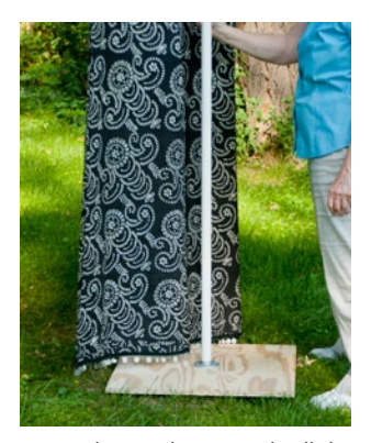
Lower the PVC banner pole all the way to the flange. Do so smoothly, without jerking, for a beautiful presentation.