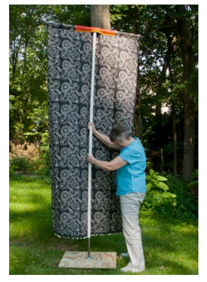
Next, ease the PVC banner pole onto the black pipe.